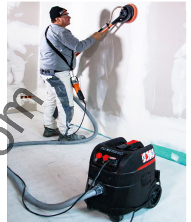
Combinable with all ROKAMAT grinding machines