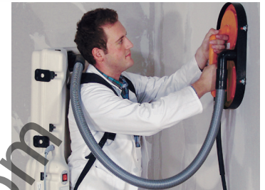
Rucksack Vacuum Cleaner in combination with CHAMELEON